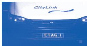
Figure 1: Digital image of LPN taken by infra red camera following exception (image reproduced here with consent of vehicle owner).